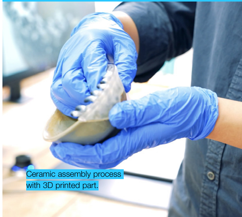
Ceramic assembly process with 3D printed part.